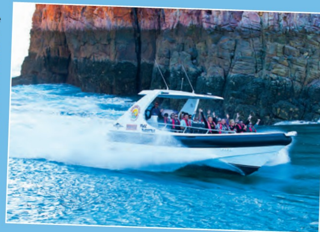
Experiencing the Horizontal Falls ▲ from water level is fun for all.

It's no secret the Horizontal Falls is a Kimberley attraction that is completely unique. And as far as natural attractions go, it's right up there. But unless your 4WD is amphibious, you'll need a plane or boat to reach them. Our first visit to the falls was way back in 2007 when Horizontal Falls Seaplane Adventures had not long kicked off their tours out of Broome. These days the falls are so popular there's a variety of half day and full day tours available that leave from either Broome or Derby. There's also another tour which includes an overnight stay if you're looking for something extra special and a bit of indulgence.