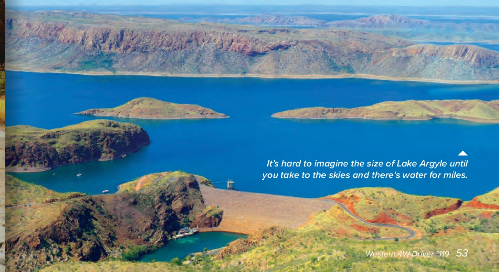
It's hard to imagine the size of Lake Argyle until you take to the skies and there's water for miles.

We'll be the first to say a visit and cruise to Lake Argyle should be on every Kimberley visitor's list, but a visit by seaplane takes things up a notch. When the full lake tops more than a phenomenal 20 Sydney Harbours in size and covers around 1,000 square kilometres, the seaplane provides an incredible experience from water level