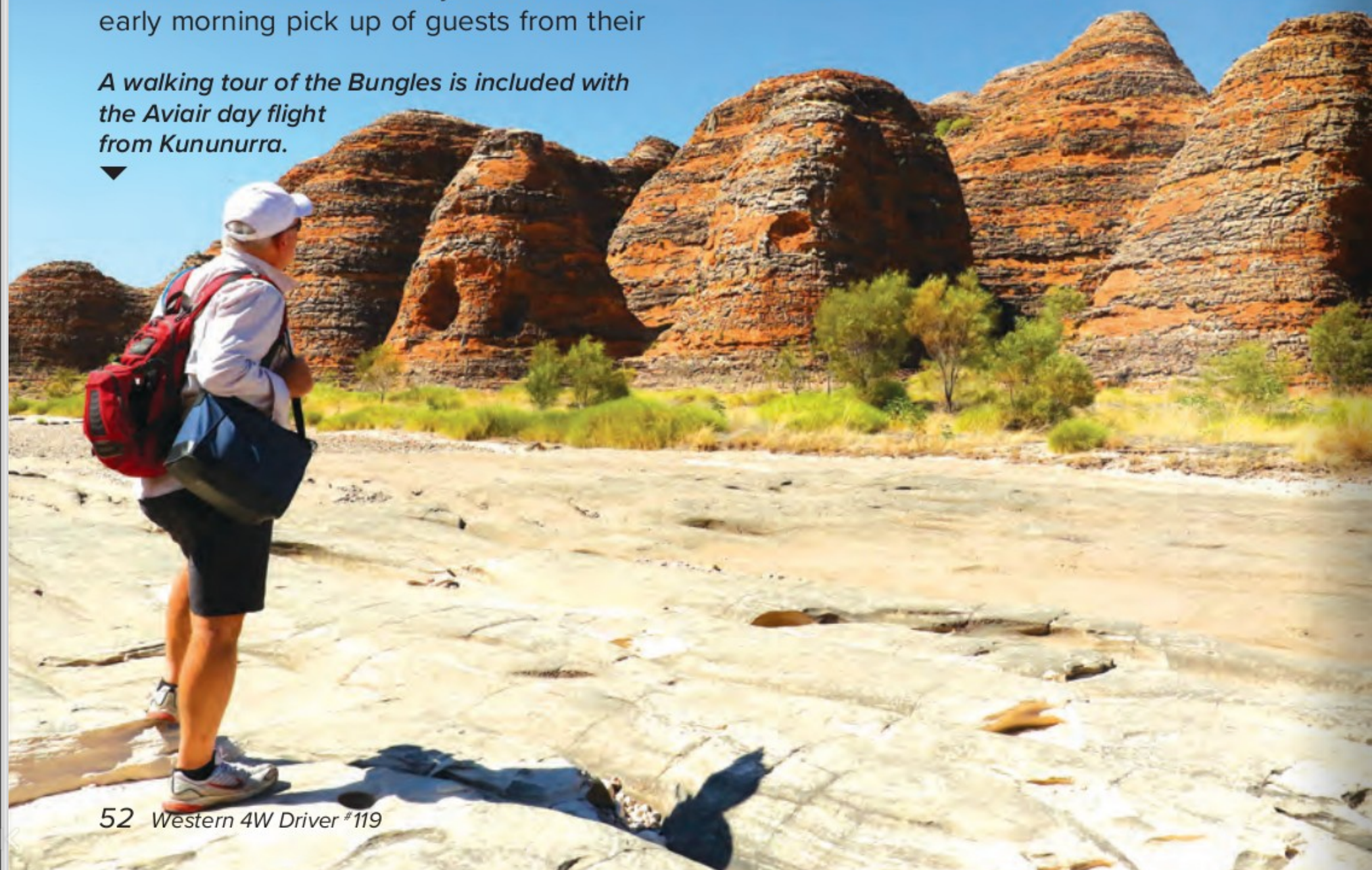
52 Western 4W Driver #119

accommodation around Kununurra. We're all briefed and weighed with our bags inside Aviair's terminal at the airport. It's about now we dreaded squeezing in that extra piece of pizza last night! After another briefing by our pilot in the plane before taking off, it's up, up and away as we take to the skies. The flight takes only an hour from Kununurra, but the scenery below grabs