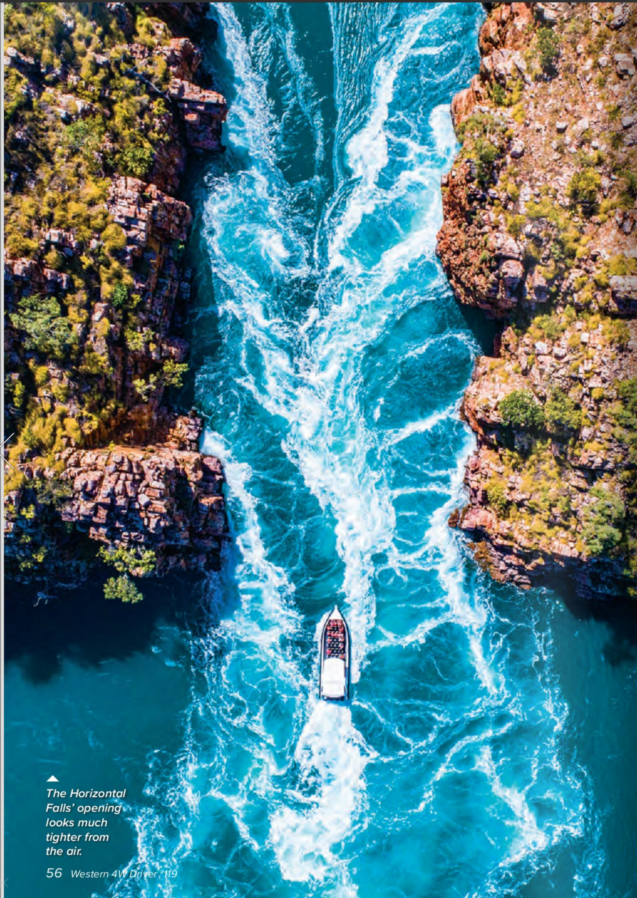
▲ The Horizontal Falls' opening looks much tighter from the air.