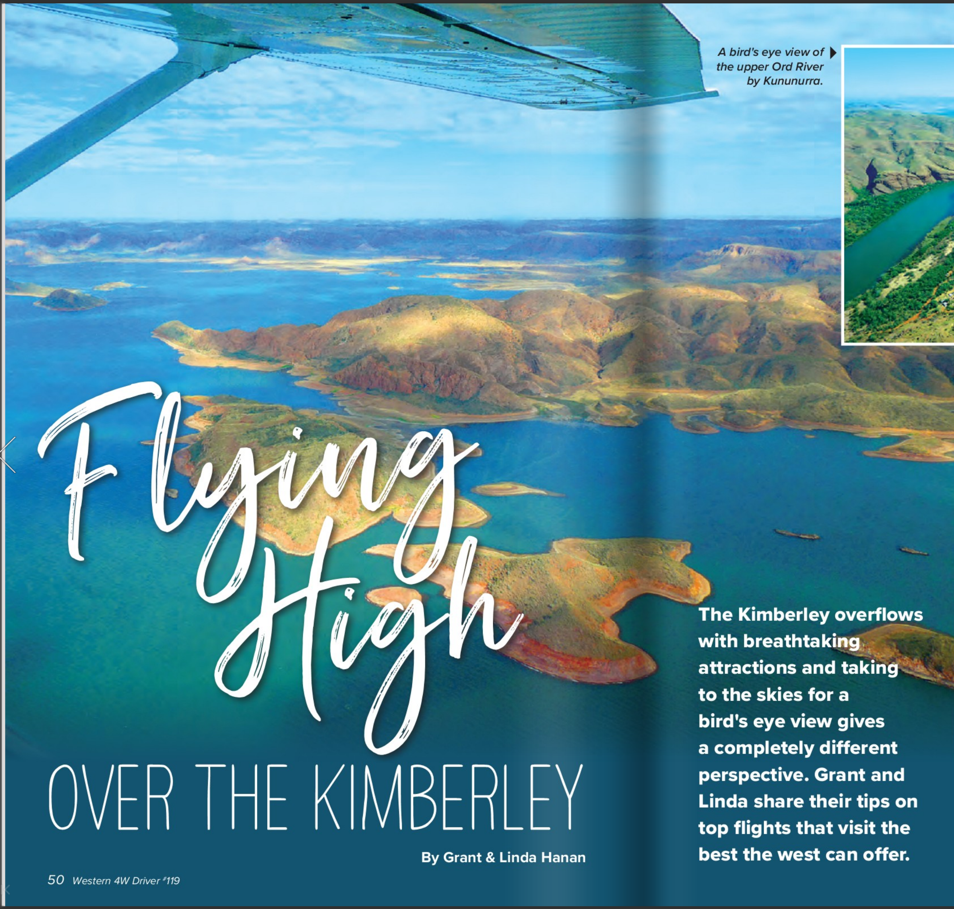
A bird's eye view of the upper Ord River by Kununurra.