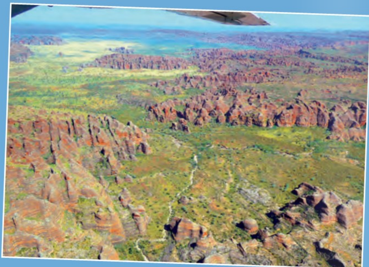
A flight over Bungle Bungle shows how widespread the domes really are.

A walking tour of the Bungles is included with the Aviair day flight from Kununurra.