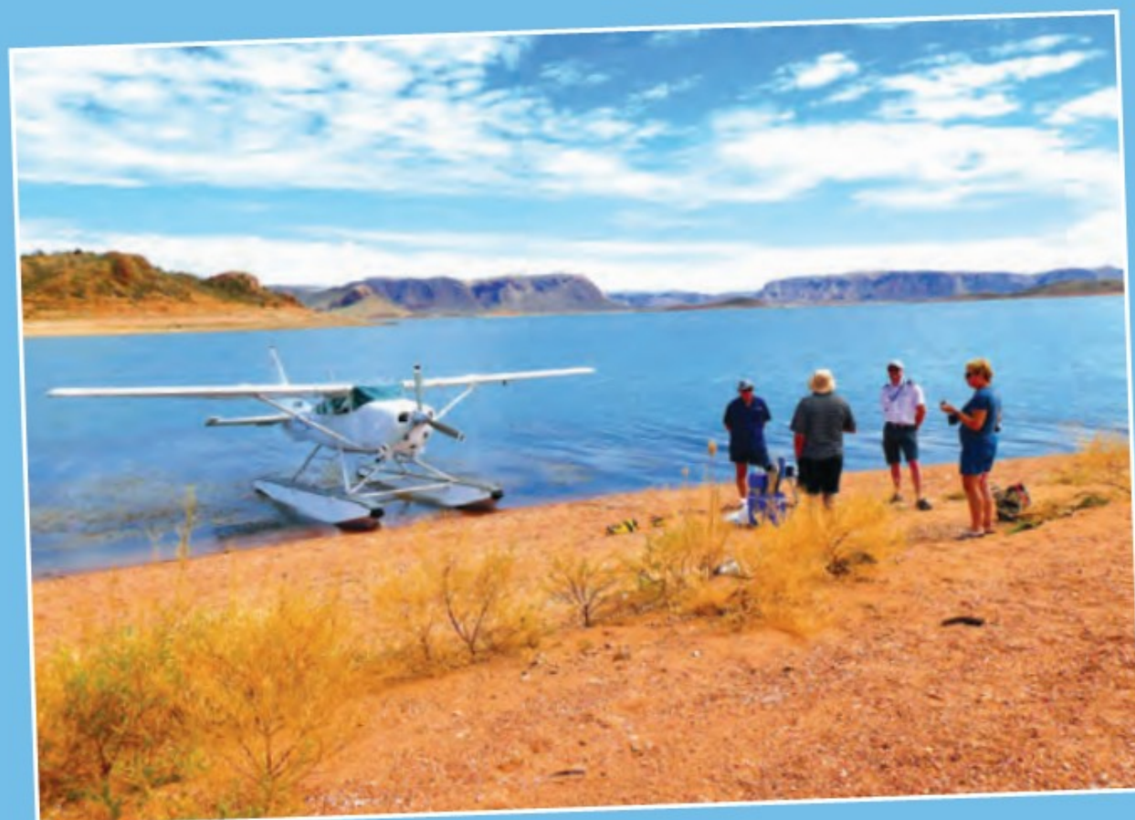
▲ Enjoying a fabulous morning tea on our own private Lake Argyle island.

as well as the air. Kimberley Air Tours are based in Kununurra and run half day tours that showcase some of the best scenery of Lake Argyle if that's ever possible. Taking off from the calm water of Lake Kununurra is a thrill in itself, but the scenery as we flew low-level towards Lake Argyle was simply out of this world. This was a highlight for the flight in general, as you get to see the lake and its islands quite close up, clearly making out flocks of birds in some instances.