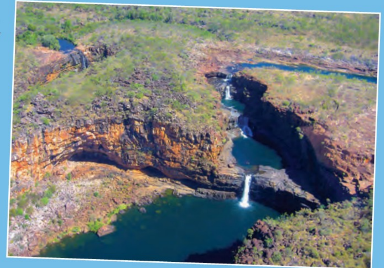
▲ Flying over Mitchell Falls provides a completely different perspective.

Our helicopter flight landed on the mudflats with the magnificent Cockburn Range as a backdrop.